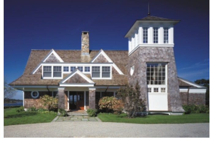
Architect: Shope Reno Wharton, Photo: Robert Benson

Note: All figures depict shingle applications. DO NOT interlay shingles or shakes with felt on sidewall applications.